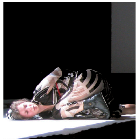
→ back to front ← / concept and performance: Mariella Greil